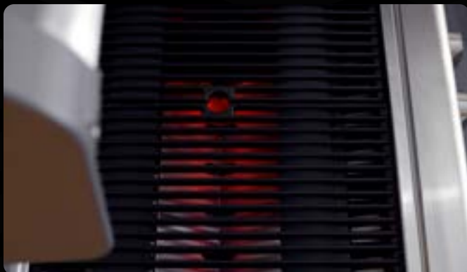
Self cleaning grill with significantly reduced flare ups