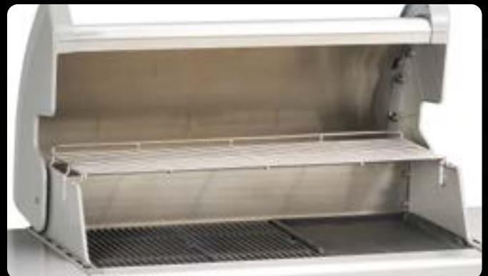
Multipurpose outdoor appliance, lid up or down