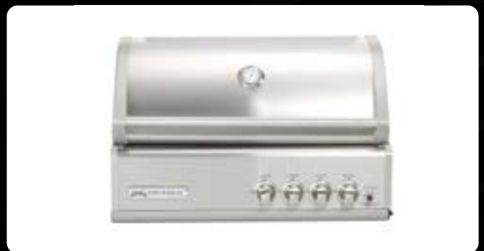
4 burner In-Built BBQ Model TCS4FL