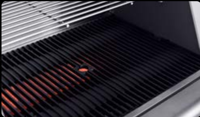
2 piece upper level cooking area