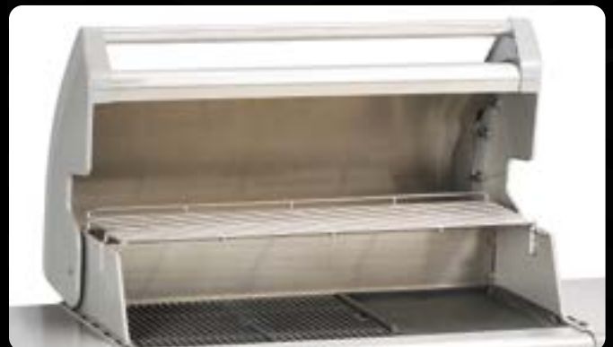
Multipurpose outdoor appliance, lid up or down