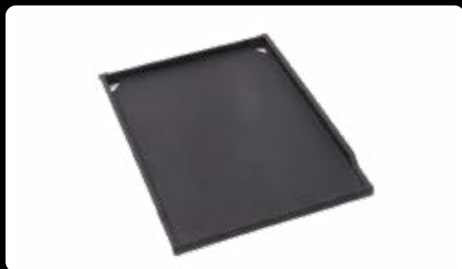
Hotplate TCS4AC-001 - Hotplate (for CROSSRAY Gas BBQ) made from Ceramic coated cast iron.