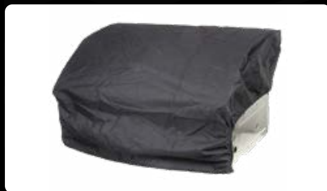
In-Built BBQ Cover TCS4AC-004 - Cover for 4 Burner in-built BBQ Woven polyester.