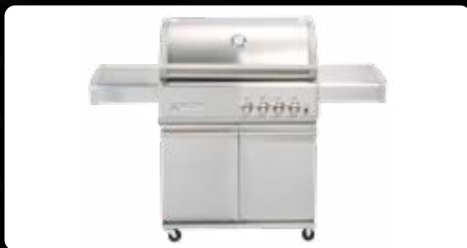
4 burner Trolley BBQ Model TCS4PL

The Range All CROSSRAY BBQ's come with grill plates as standard