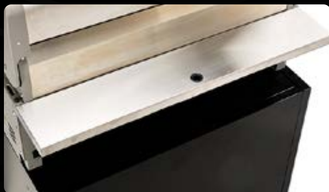
In-Built Rear Kit TCS4AC-009 - Built-in kit for 4 Burner in-built BBQ.