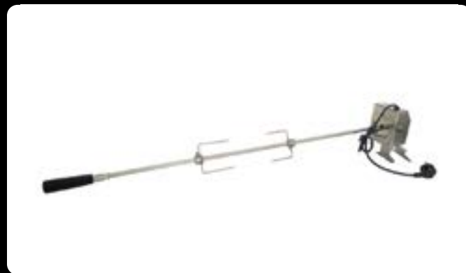
Rotisserie Kit TCS4AC-008 - Rotisserie kit for 4 Burner BBQ.