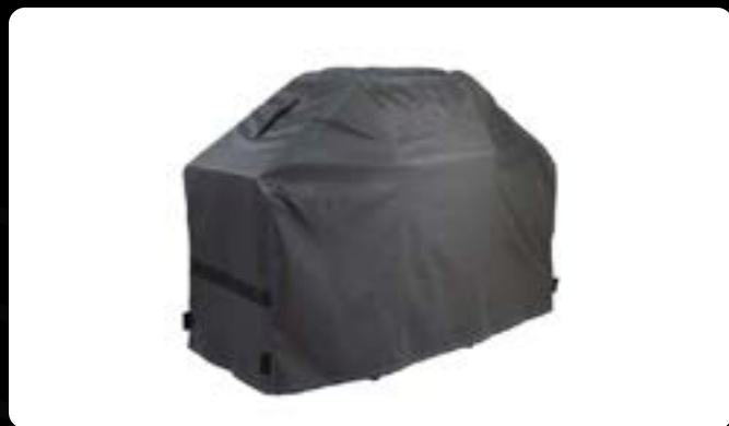
Trolley BBQ Cover TCS4AC-002 - Cover for 4 Burner trolley BBQ Woven polyester.