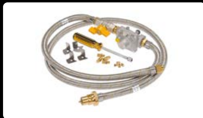
NG Conversion Kit TCS4AC-003 - Natural gas conversion kit - brass jets, Alloy NG regulator.